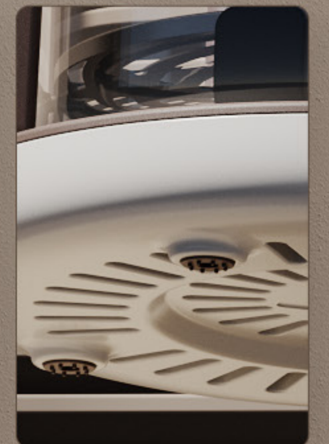
Anti-slip silicone pad