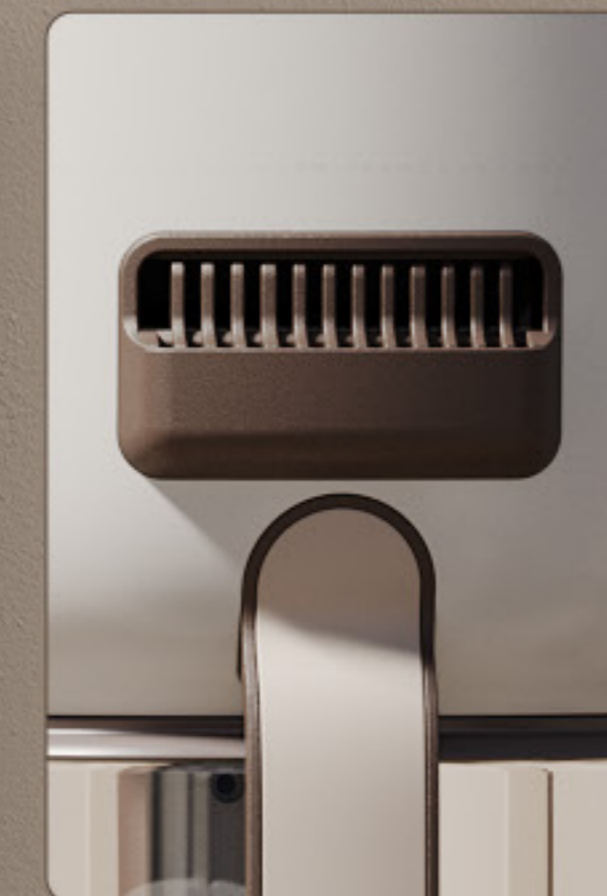
Cooling air outlet