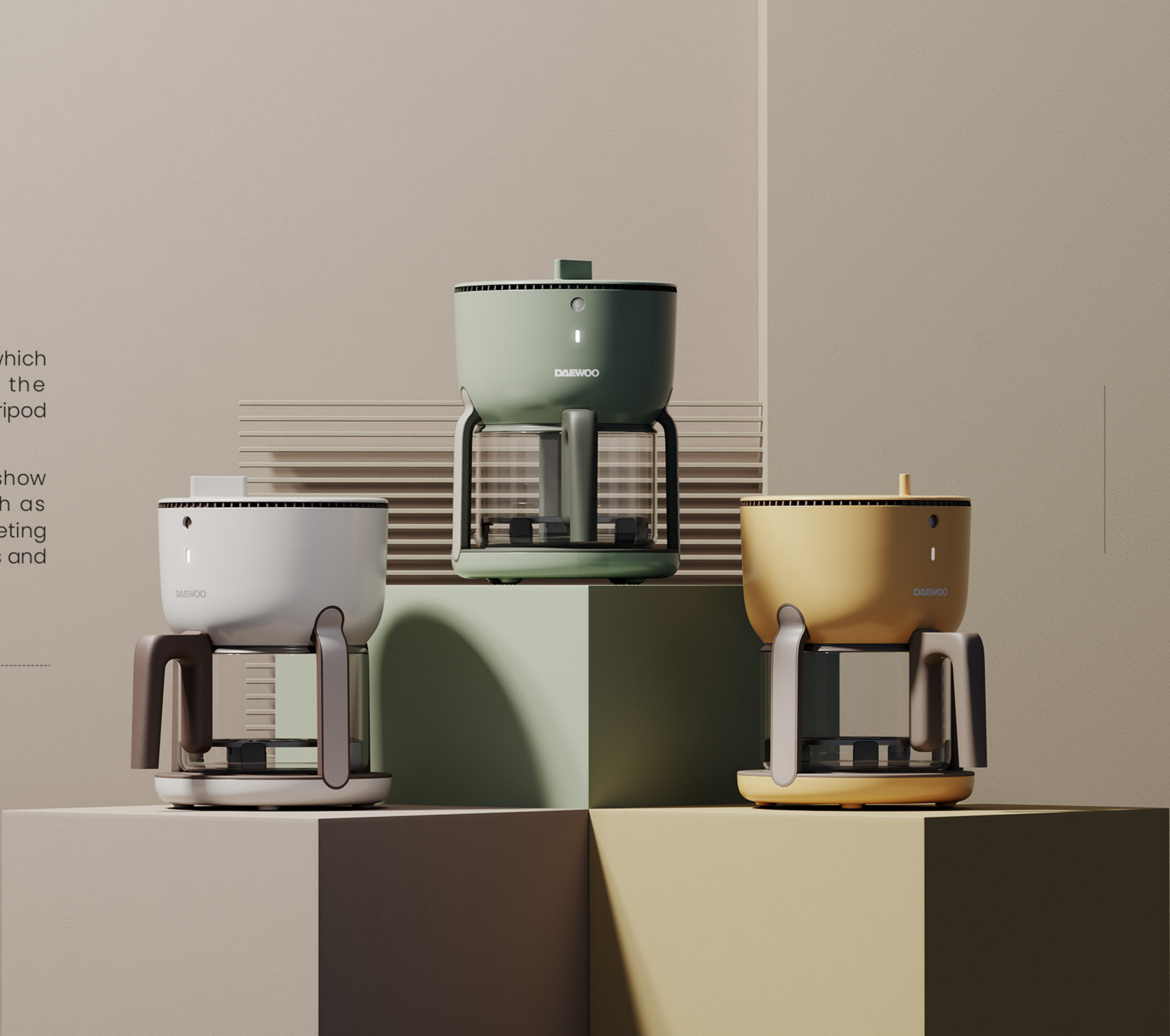
● ● # DAEWOO K5 #

so that the glass liner in the lower half can show the changes of food to the user as much as possible, which is minimalist and elegant, meeting the design requirements of modern aesthetics and improving your home vibe.